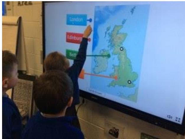
2 - We have been learning about the countries around the world and locating capital cities.