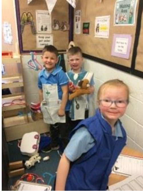
1 - We have loved our vet role play area.