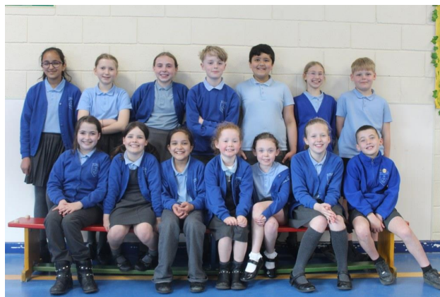
1 - Our amazing Rights Respecting Ambassadors