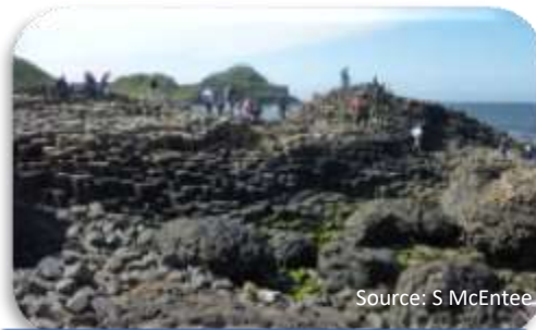
Giant's Causeway, Northern Ireland